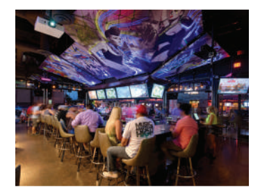
3 Distinct Event Spaces